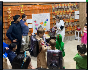
Fall Festival was a blast and a little cold!