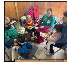
Awana kids practice their verses