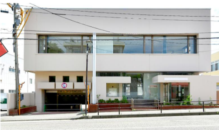
Front of potential building