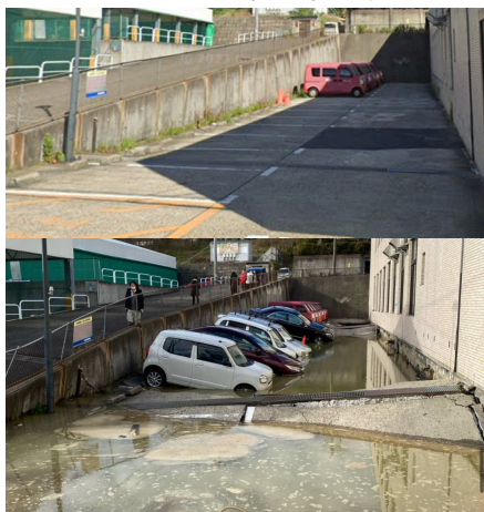
Our local post office parking before/after earthquake damage