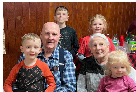
The kids with their great grandparents

Thank you to all of you who have already given and who have supported us for these 8 years of ministry in Japan! To God be the glory!!