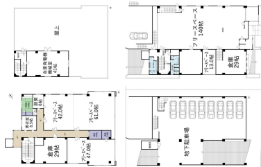
Floor plan showing parking and a flat roof that could be used as an outdoor space