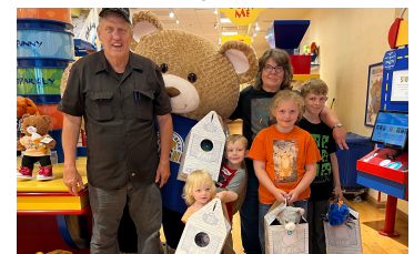
Kids spending time with their grandparents