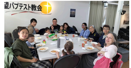
International church enjoying a meal together