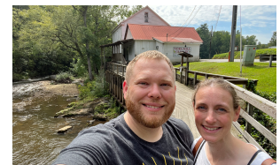
Rebel and I celebrating our 15th anniversary