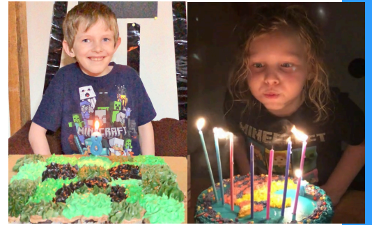
Thank you to all those that made these two's birthday special!