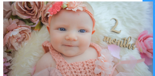
Ocean is getting bigger and even cuter!