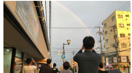
Rainbow over the church during BBQ in July