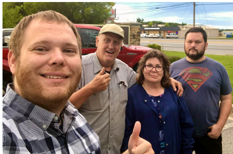
Mom, after she was declared cancer free!

On July 30th, we received news that Japan changed the part of the travel ban that affects us. There are some requirements that we will need to complete such as getting tested within 72 hours of our flight and filling out some paper work, but for the moment it seems we may be able to return in August! I was hoping to be able to give a clear timeline of our return to Japan in this letter, but as this news was just released we are still uncertain of an exact date of return. We will first need to confirm that we are indeed eligible and submit the appropriate paperwork. On August 16th, I am scheduled to preach at our home church in Dawsonville, GA, and hopefully after that we will be able to return to Japan to continue the work God has called us to do!