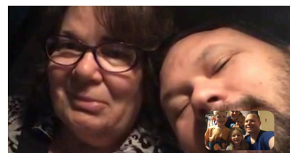
Praying with mom, before her surgery